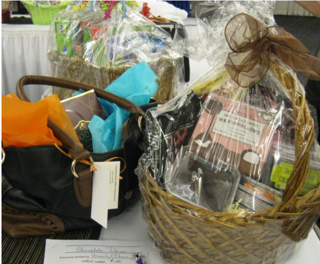
Chocolate Purse and Basket